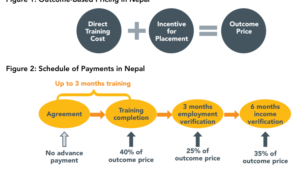
Figure 1: Outcome-Based Pricing in Nepal